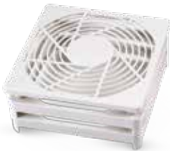
VisiJet PXL + Salt Water infiltrant, ideal for very economical monochrome models

Choose from a range of finishing options to meet your application requirements, from ColorBond infiltration for stronger functional prototypes to wax for creating concept models quickly, safely and affordably.