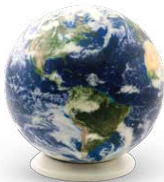
Multi-color globe model 3D printed with gradient blending.

Warranty/Disclaimer: The performance characteristics of these products may vary according to product application, operating conditions, material combined with, or with end use. 3D Systems makes no warranties of any type, express or implied, including, but not limited to, the warranties of merchantability or fitness for a particular use.