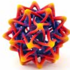
VisiJet PXL + Wax infiltrant for fast, affordable, beautiful color models