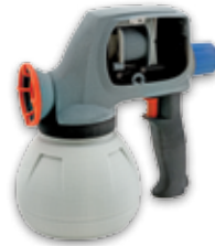
VisiJet PXL + StrengthMax infiltrant to dramatically improve the strength of this paint gun ergonomic prototype