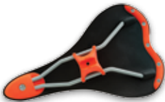
VisiJet PXL + ColorBond infiltrant for improved strength and color vibrancy of this bicycle seat model